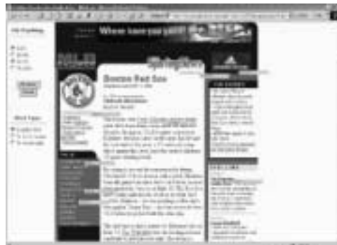
Figure 1: The OSM Tool

To present per-link statistics to the analyst, the OSM tool overlays values directly onto a re-rendered version of the original web page. A rectangular box containing the statistic for a given link is placed over the lower-right corner of the link itself. The length of this rectangle depends upon the value of the displayed statistic to provide the analyst with a preattentive notion of link quality and usage without reading the statistic values themselves. In order to view the statistics of links with comparable values, the OSM tool divides the links into four “buckets” of equal size, each containing links of similar statistical value. Any subset of these buckets can be viewed by clicking on the checkboxes on the left